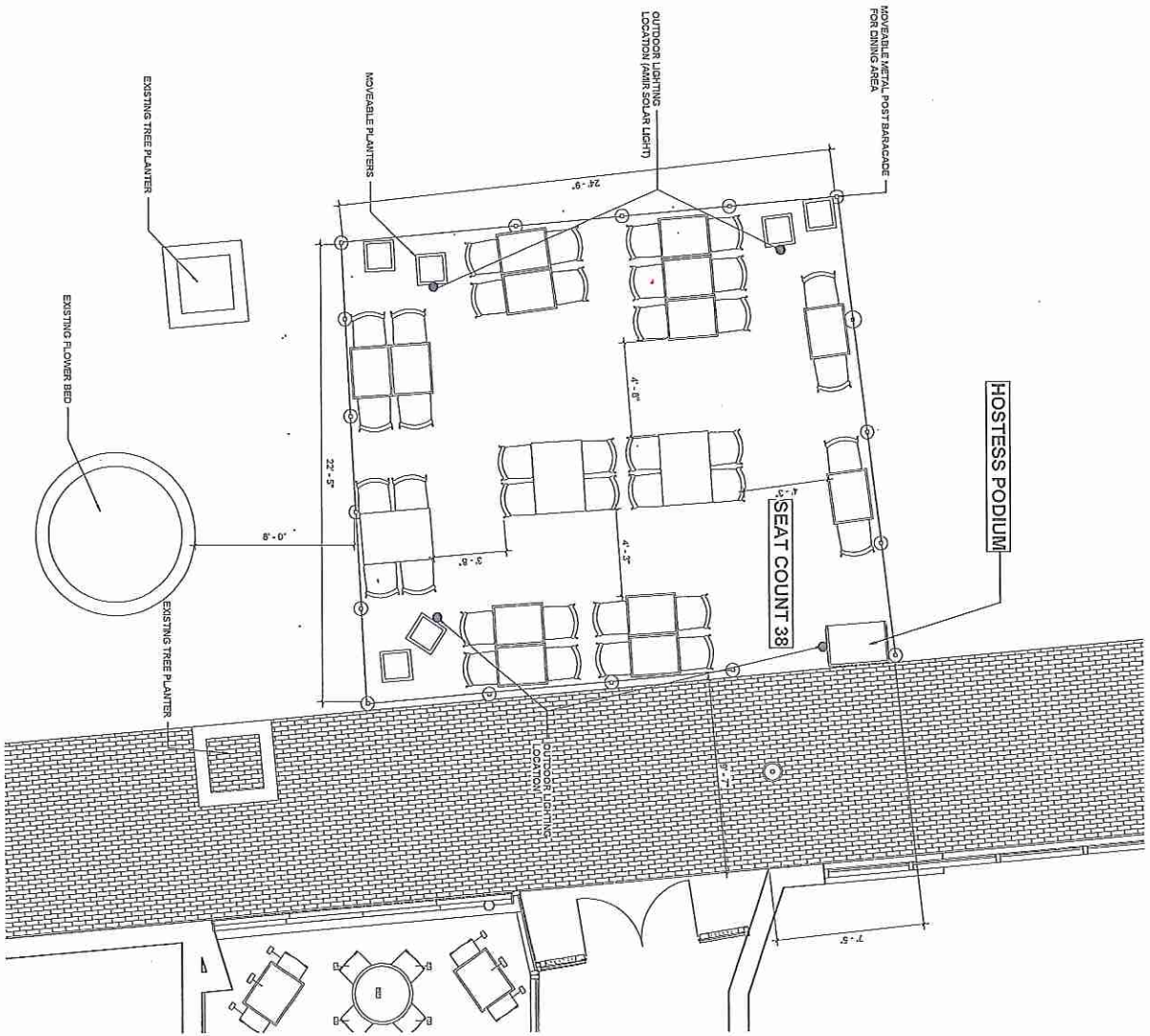
3 Outdoor Seating Plan 3/8" = 1'-0"