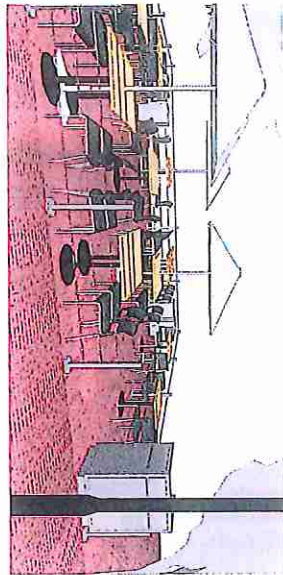
2 OUTDOOR SEATING SCHEMATIC VIEW 2