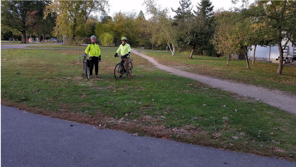
Proposed RTC Sign Location - near Alewife terminus