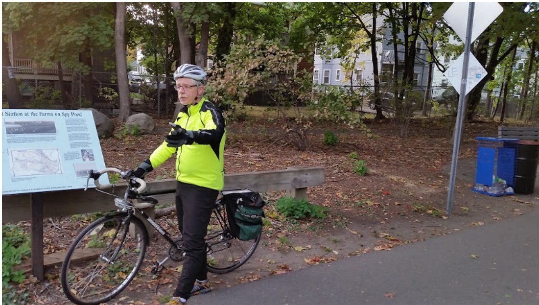
Proposed RTC Sign Location - Lake Street, former rail-station location