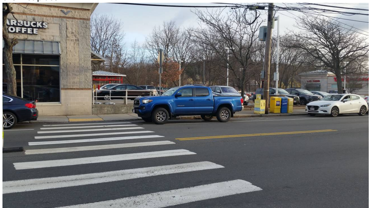
<u>Figure 2</u>: Vehicles parked directly before the crosswalk block visibility of pedestrians entering the crosswalk

Although not related specifically to visibility, the vehicle travel lanes in this segment of Mass Ave are 15' wide, which can contribute to higher speeds by drivers. Higher speeds increase the distance by which drivers can safely stop to yield to pedestrians, limits their reaction time, and reduces their field of vision in order to see pedestrians at the edge of the road in the first place.