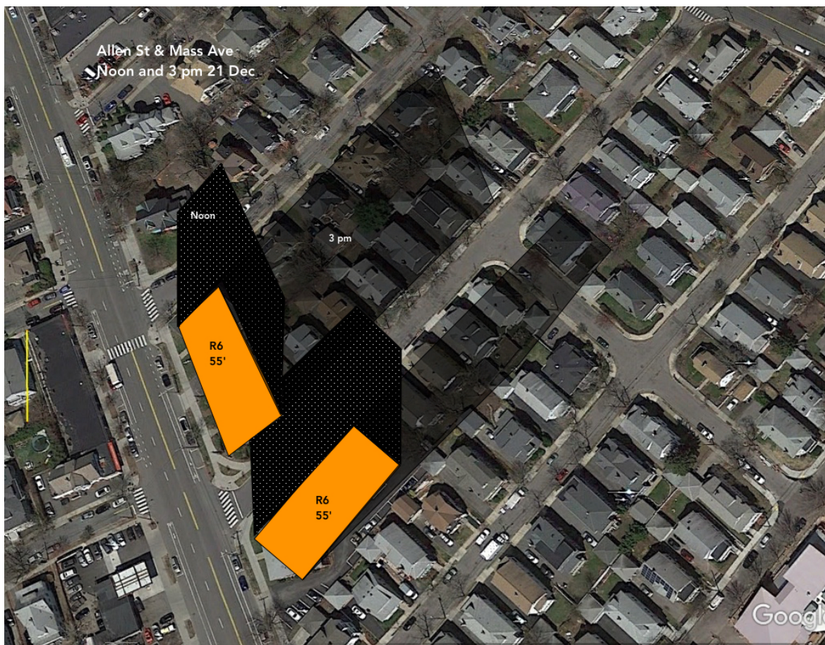
Allen St small apartments 57% longer (max height and height buffer zone)