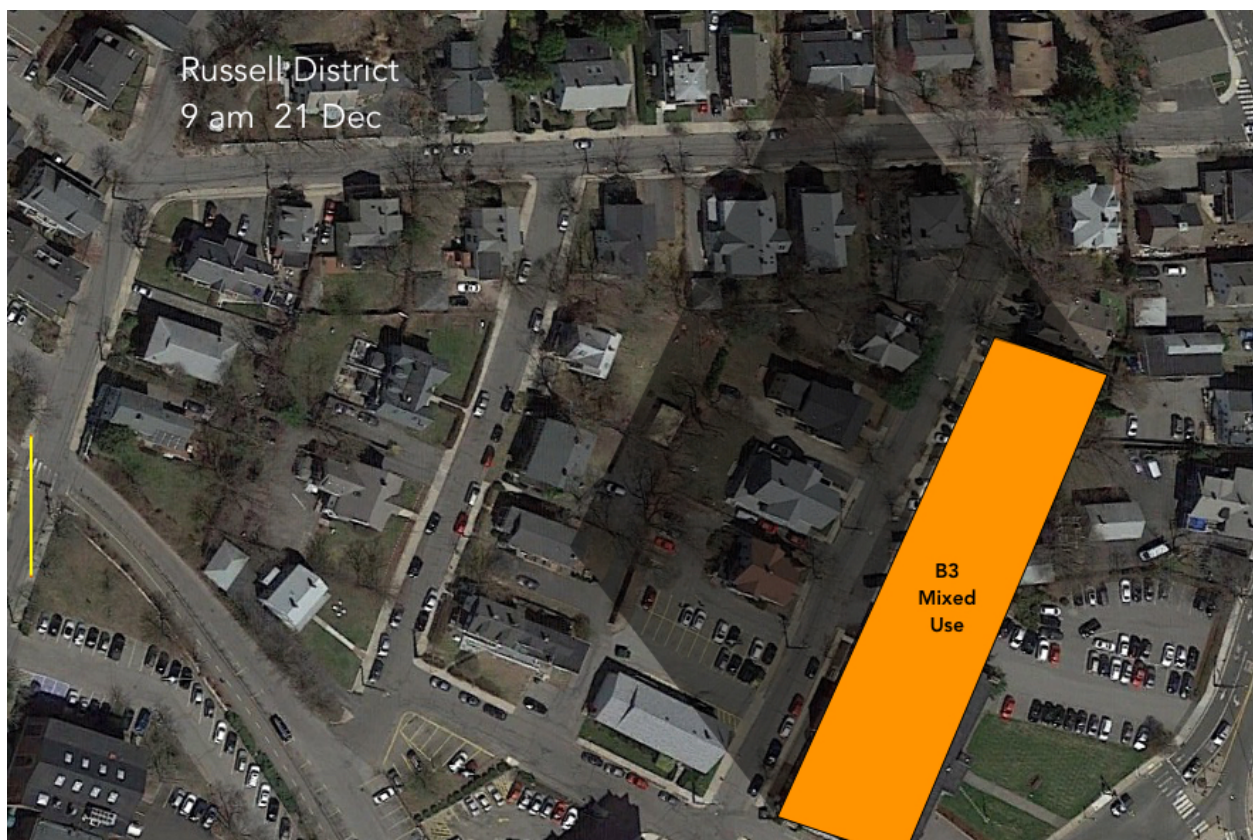
Russell Historic District 50% longer (max height and height buffer zone)