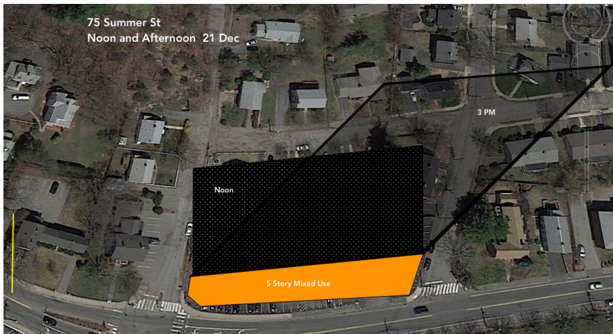
Summer St, Fresh Pond Seafood, B4 20% longer (height buffer zone)