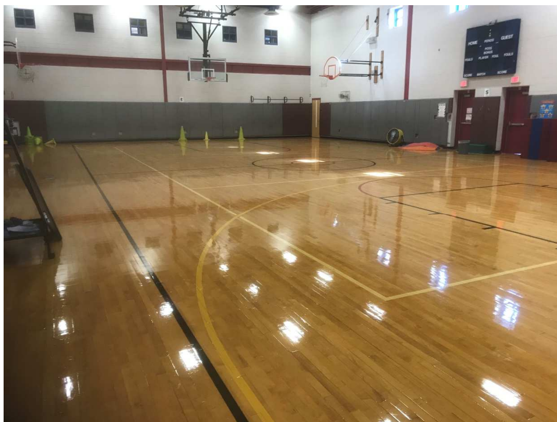
Refinished gym floor at Brackett School