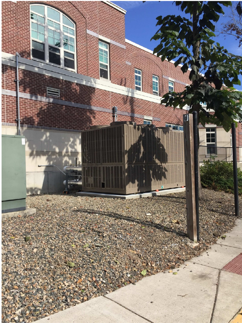
New chiller at Dallin School