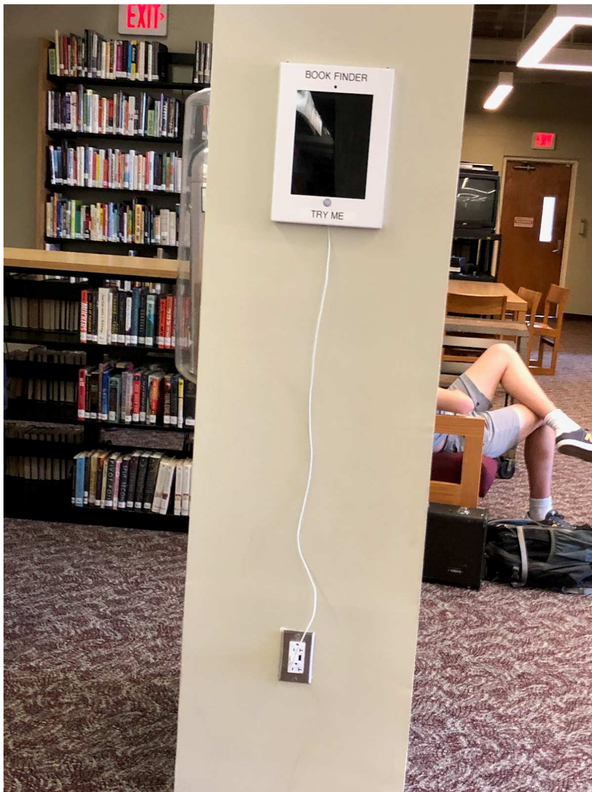
New iPad installed in AHS Media Center (5 total)