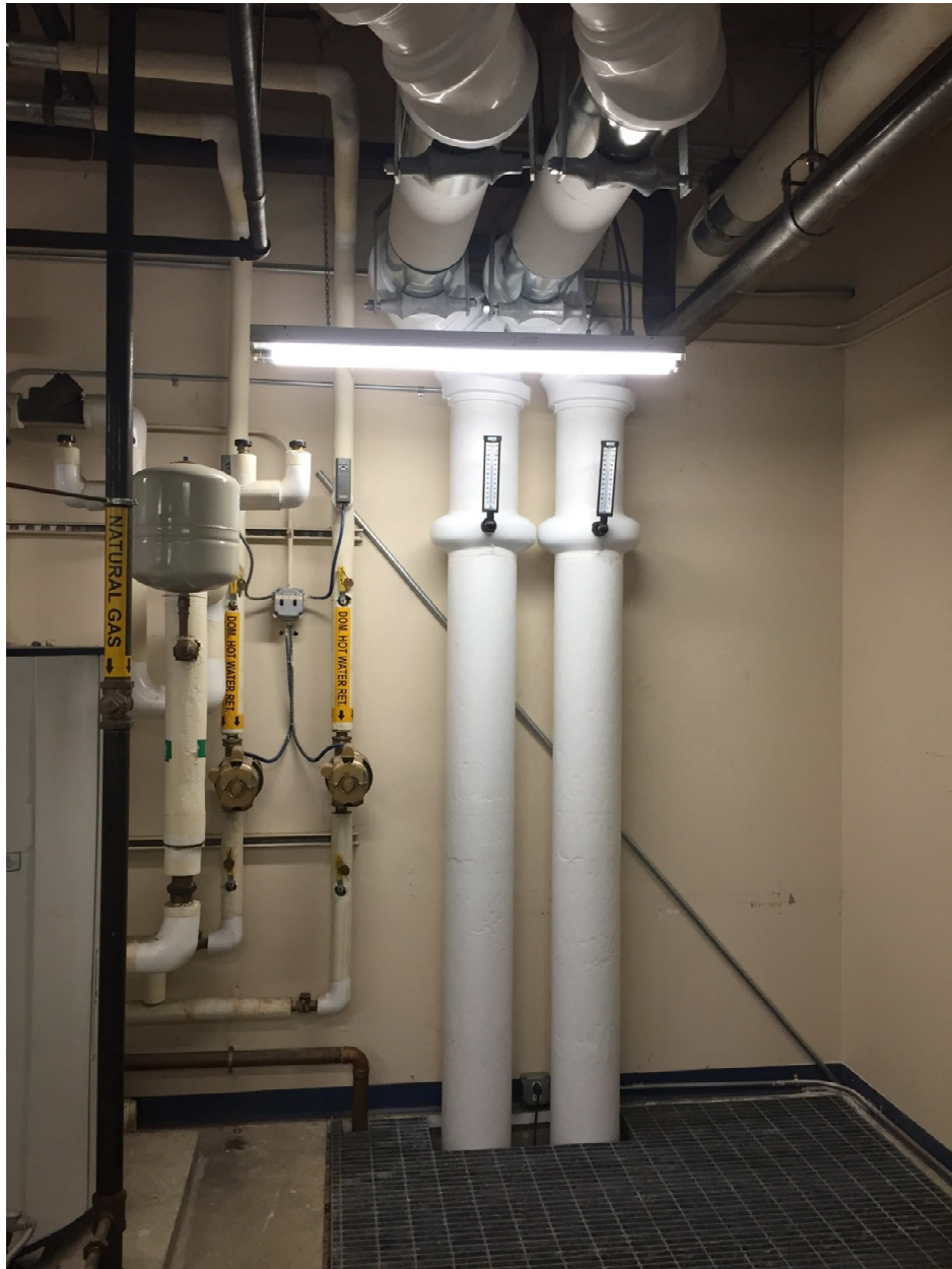
New chiller piping at Dallin School