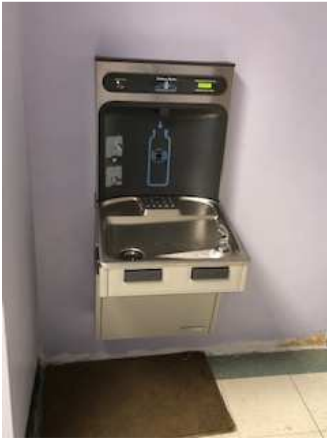
New water fountain at Hardy School