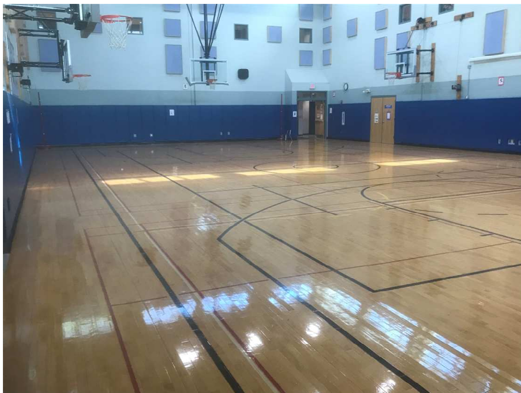
Refinished gym floor at Dallin School