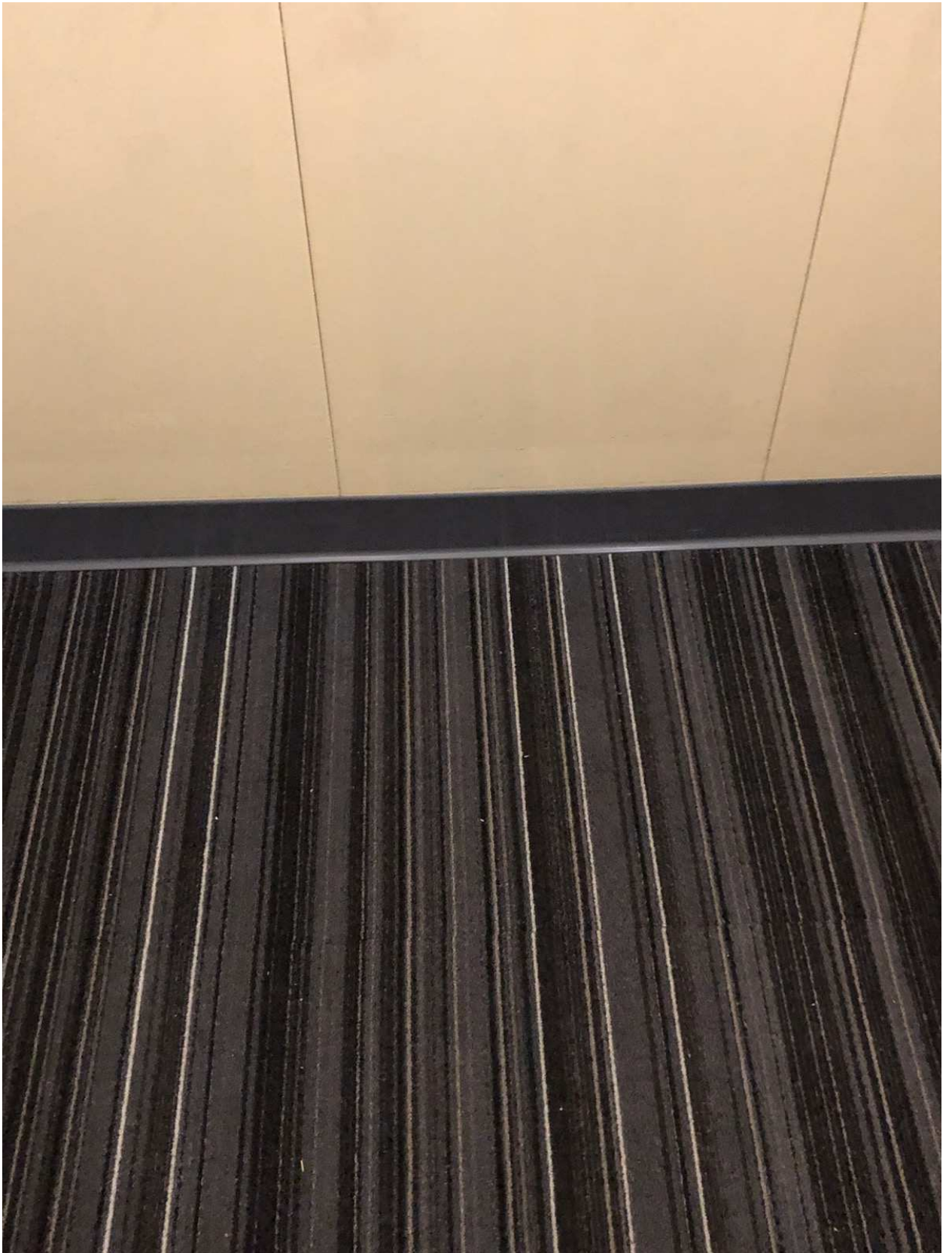
Interior finish upgrades to AHS passenger elevator cab