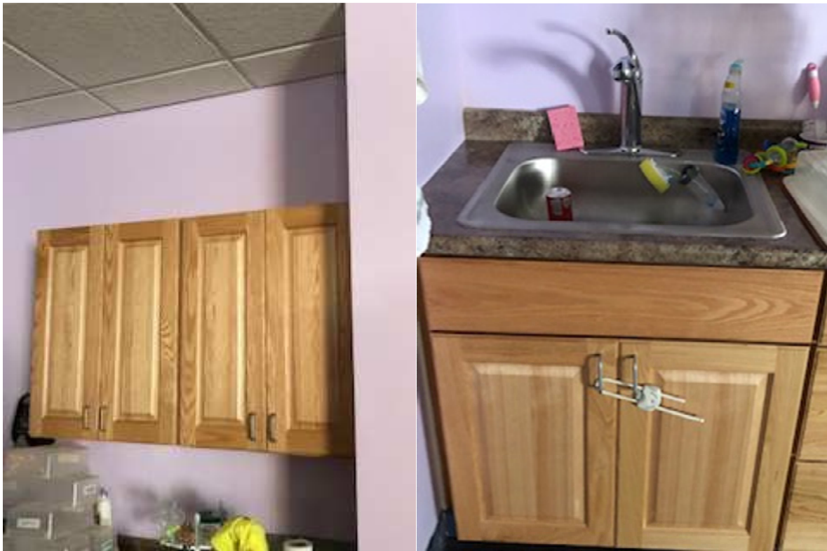
New cabinets, sink and countertop at Hardy School