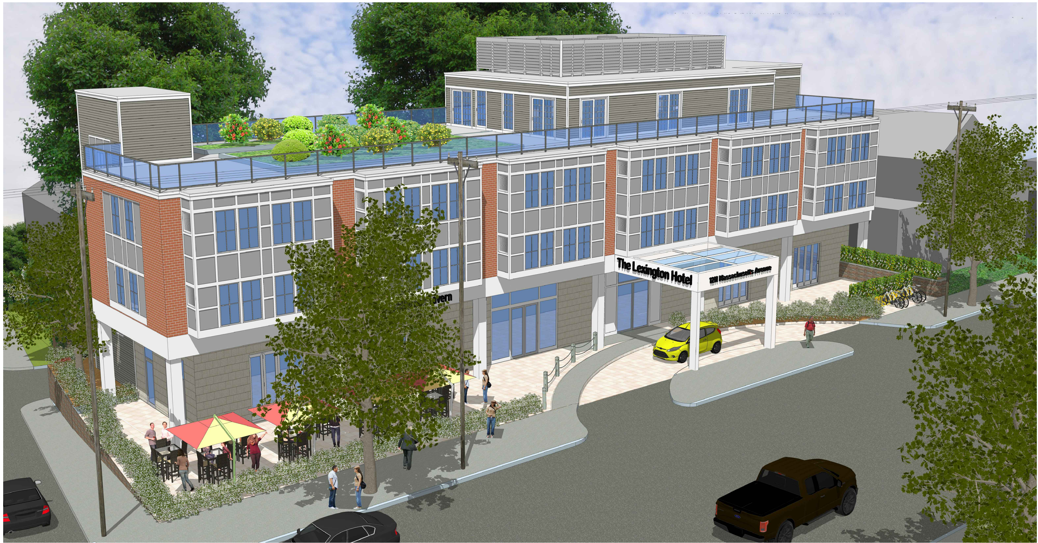
ALTERNATE FOURTH FLOOR VIEW