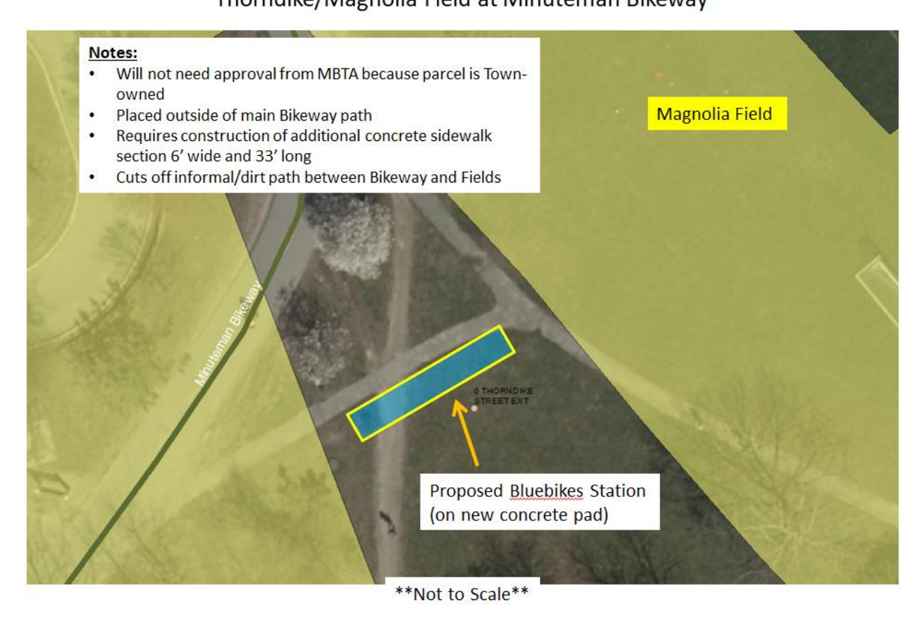
Figure 2 Thorndike/Magnolia Field at Minuteman Bikeway

Figure 2 shows the proposed location of the bike share station on town-owned property. The yellow polygons represent Bikeway right-of-way or open space. The station is located next to a narrow paved path the leads between the Bikeway and a path that curves along the edge of Magnolia Field. This paved path is too small for a bike share station and as a result a hardscape surface would need to be constructed. The Department of Public Works has confirmed they have the staff and material capacity to construct an asphalt pad 33' long by 6' wide where the station will be placed. The pad will be constructed to the same specifications as a town sidewalk to ensure proper slopes and foundation. The location of the station would also cut off a worn dirt path that appears to operate as an alternative or shortcut between two parts of the Bikeway (the path can be easily seen in the satellite image going north to south. This station will be able to function over the winter because it is off-street.