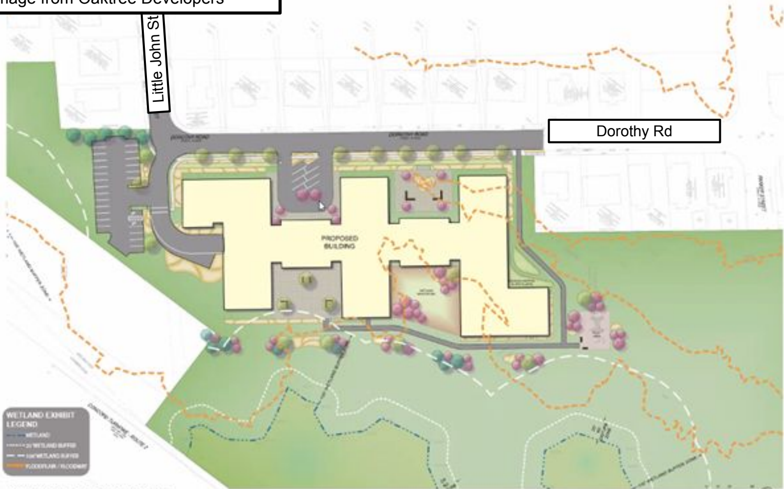
ILLUSTRATIVE LANDSCAPE PLAN THORNDIKE PLACE DOROTHY ROAD IN ARLINGTON MASSACHUSETTS

Here is the Image from Oaktree Developers