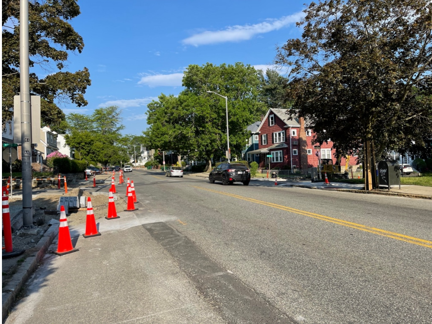
3. High Street (Route 60) at Mystic Street