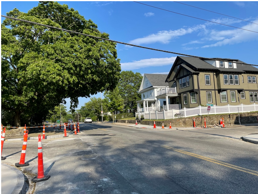
2. High Street (Route 60) at Wolcott Street.