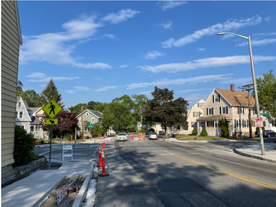
1. High Street (Route 60) at Woburn Street.