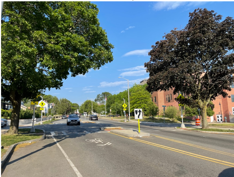
4. High Street (Route 60) at Allston Street