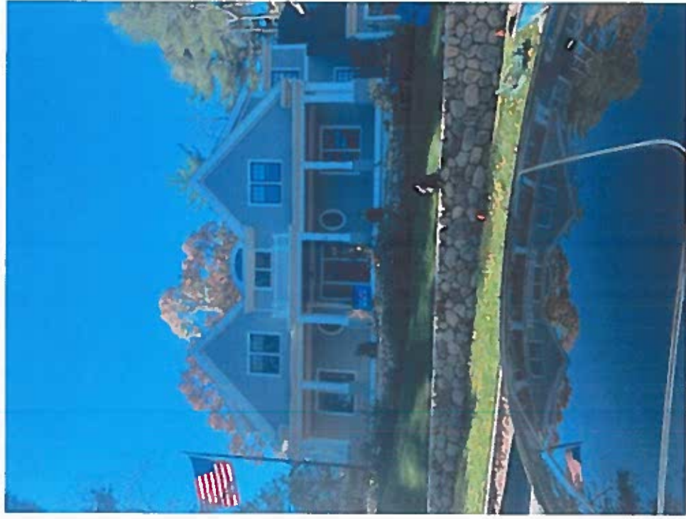
5 Old Middlesex Path.