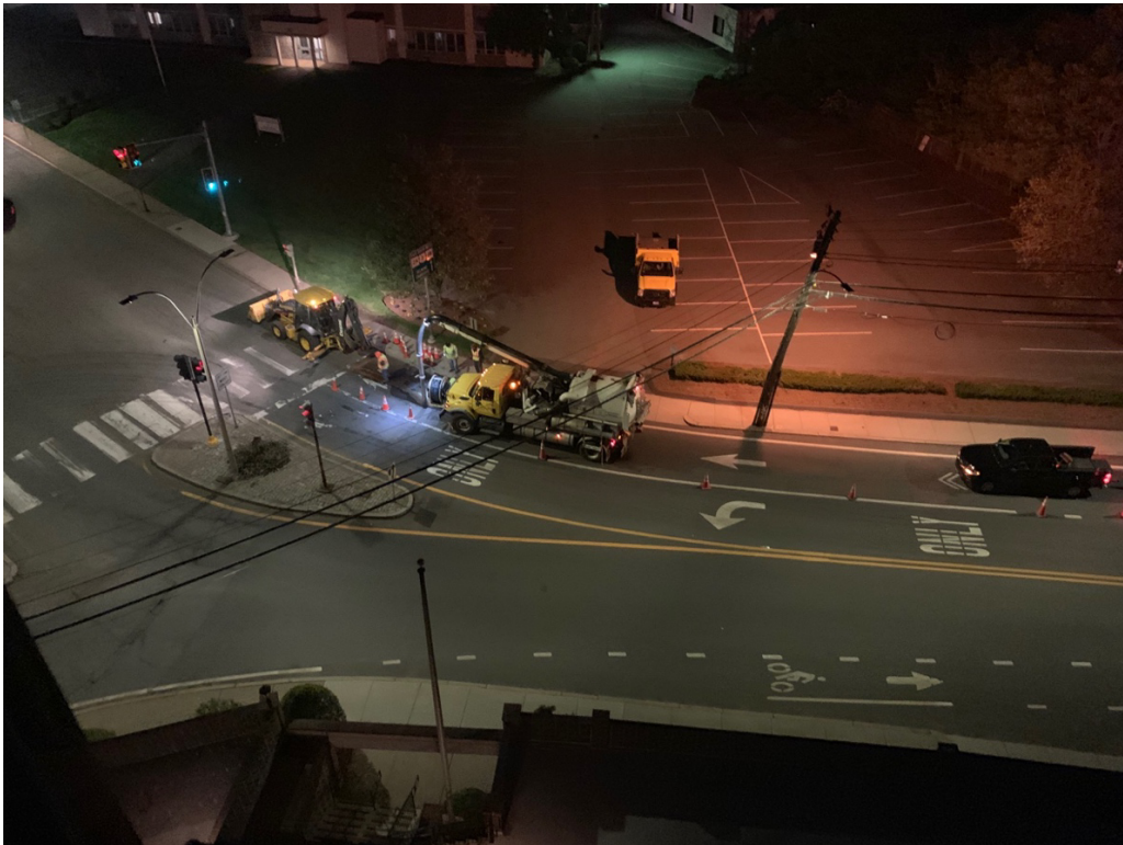
Use of sewer jetting truck. May 9, 2019 4:30 a.m.