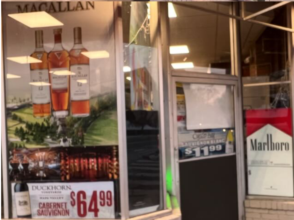
BB Liquors, 1215 Massachusetts Avenue. March 2, 2022