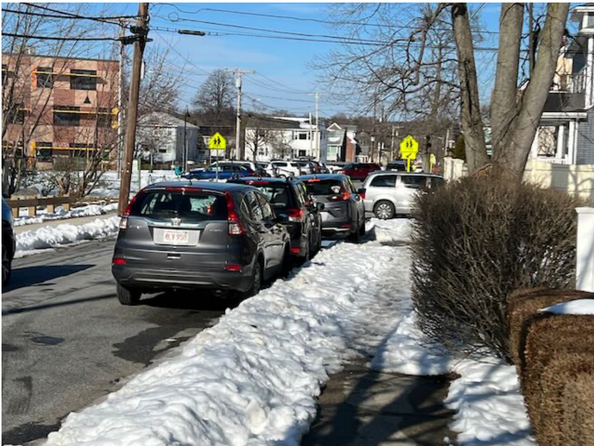
North Union Street near Thompson School, five days after storm. March 2, 2022

Rationale: During the 2021 Annual Town Meeting, the building inspector said inspectional services focuses on building safety and standards, and does not enforce other town bylaws. Many municipalities, including Fort Worth TX, divide code enforcement into two divisions, one pertaining to building standards and the other focused on quality of life and zoning issues. By creating a Code Enforcement Officer position in the Department of Planning & Community Development, unenforced bylaws (such as signs and snow removal) can be enforced. As the building inspector is listed as the enforcement officer in the town bylaws, it is necessary to add this new position somewhere in the bylaws in order to grant this person the ability to take enforcement action.