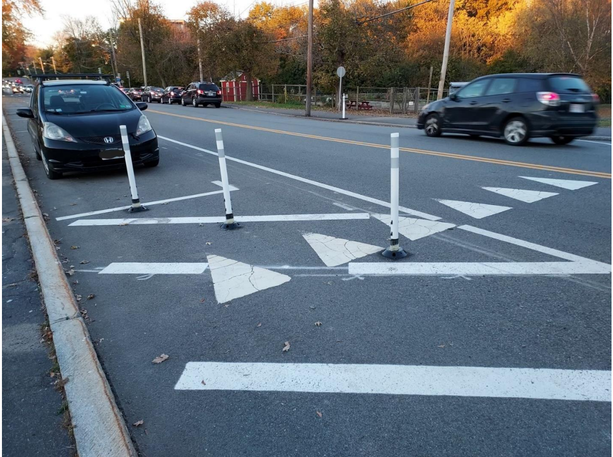
Figure 3: Pavement markings and bollards use to prevent illegal parking near a crosswalk on Winthrop Street in Medford.

crosswalk into compliance with MUTCD guidelines. The Town also may consider installing flexible bollards or similar infrastructure to prevent illegal parking in this area and preserve visibility. An example of this strategy can be found in Medford on Winthrop Street near the Mystic Valley Parkway in Figure 3.