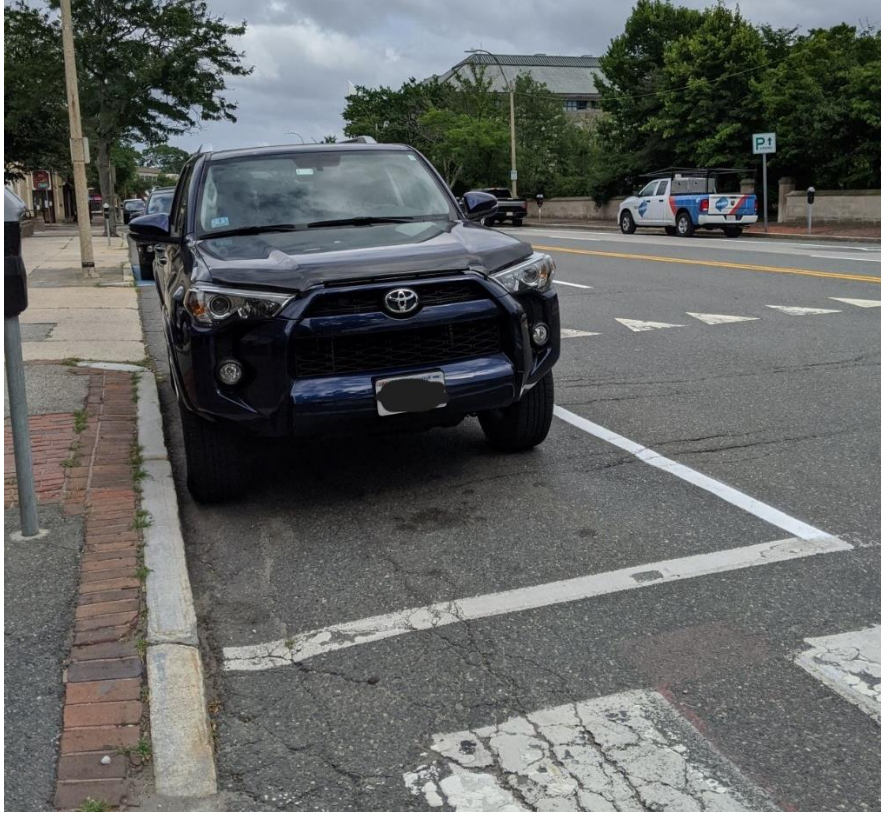
Figure 2: Cars parked in front of the crosswalk obstruct visibility for pedestrians and drivers.

Further, this parking spot does not conform to the guidelines set out in Manual on Uniform Traffic Control Devices (MUTCD, 2009) Chapter 3B.16.12, because parking spaces should not be placed between the yield lines and the crosswalk: