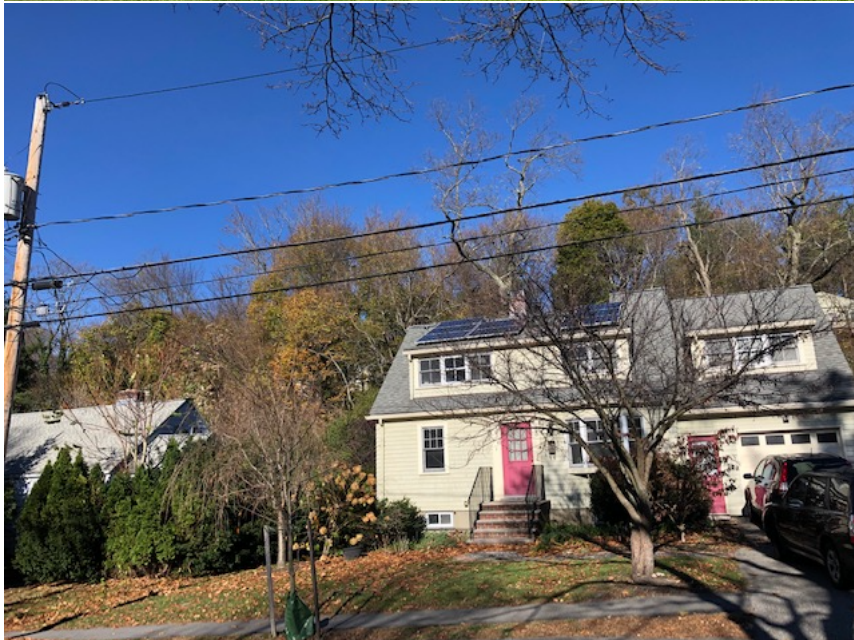
46 Oak Hill on the left and 50 Oak Hill on the right.