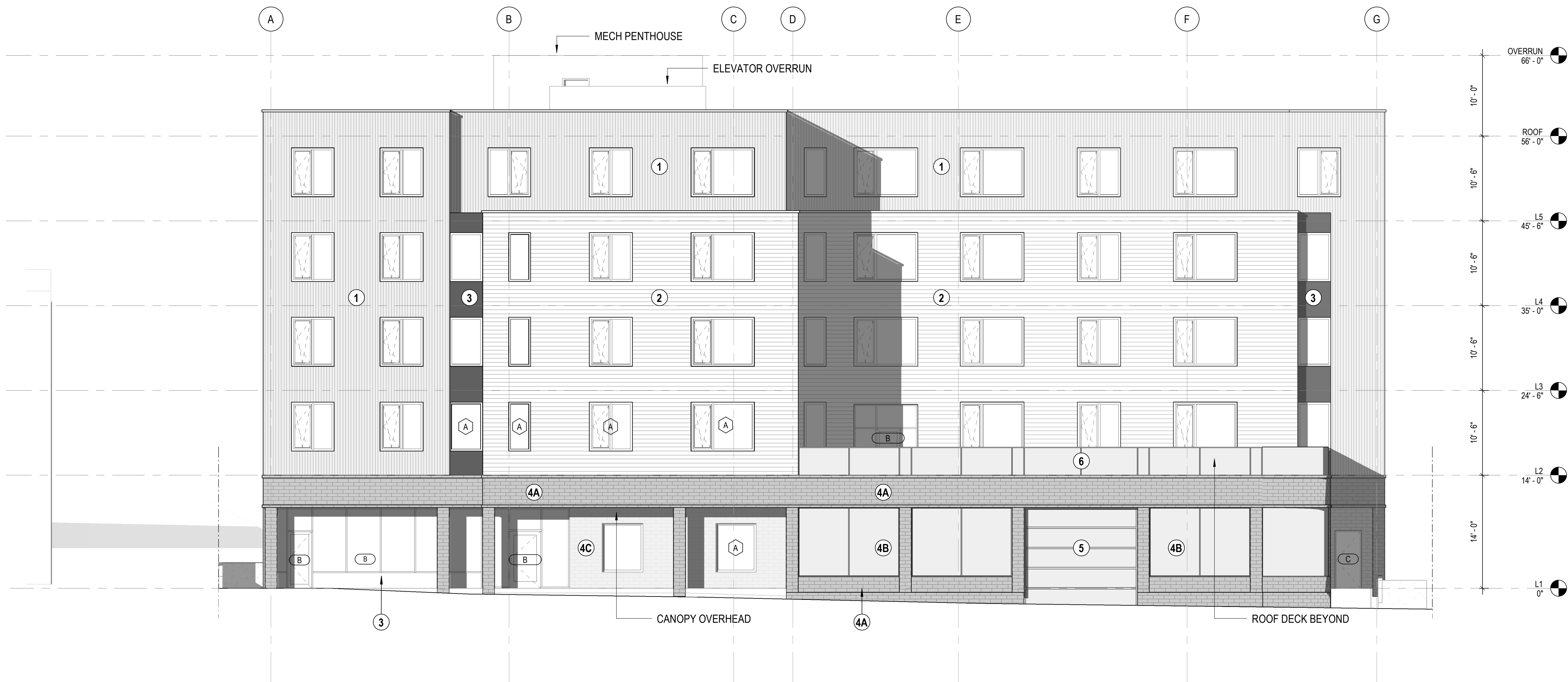
1 EAST ELEVATION (SUNNYSIDE AVE) 1/8" = 1'-0"