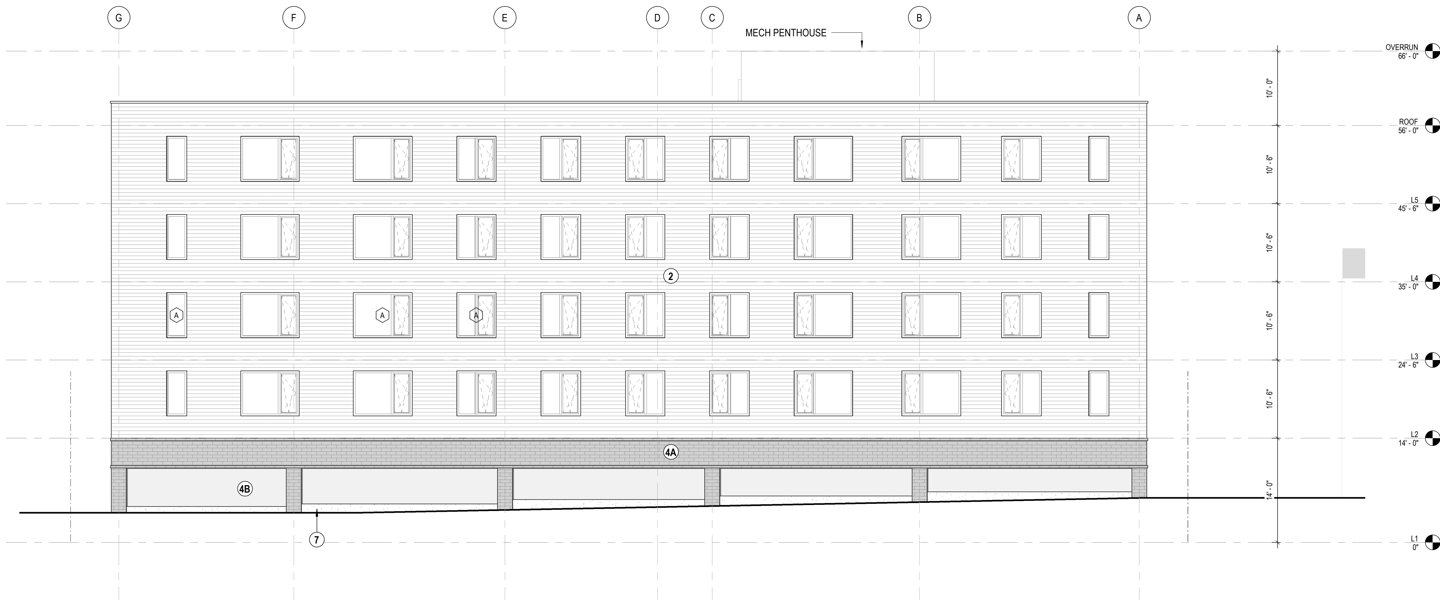
1 WEST ELEVATION (REAR) 1/8" = 1'-0"