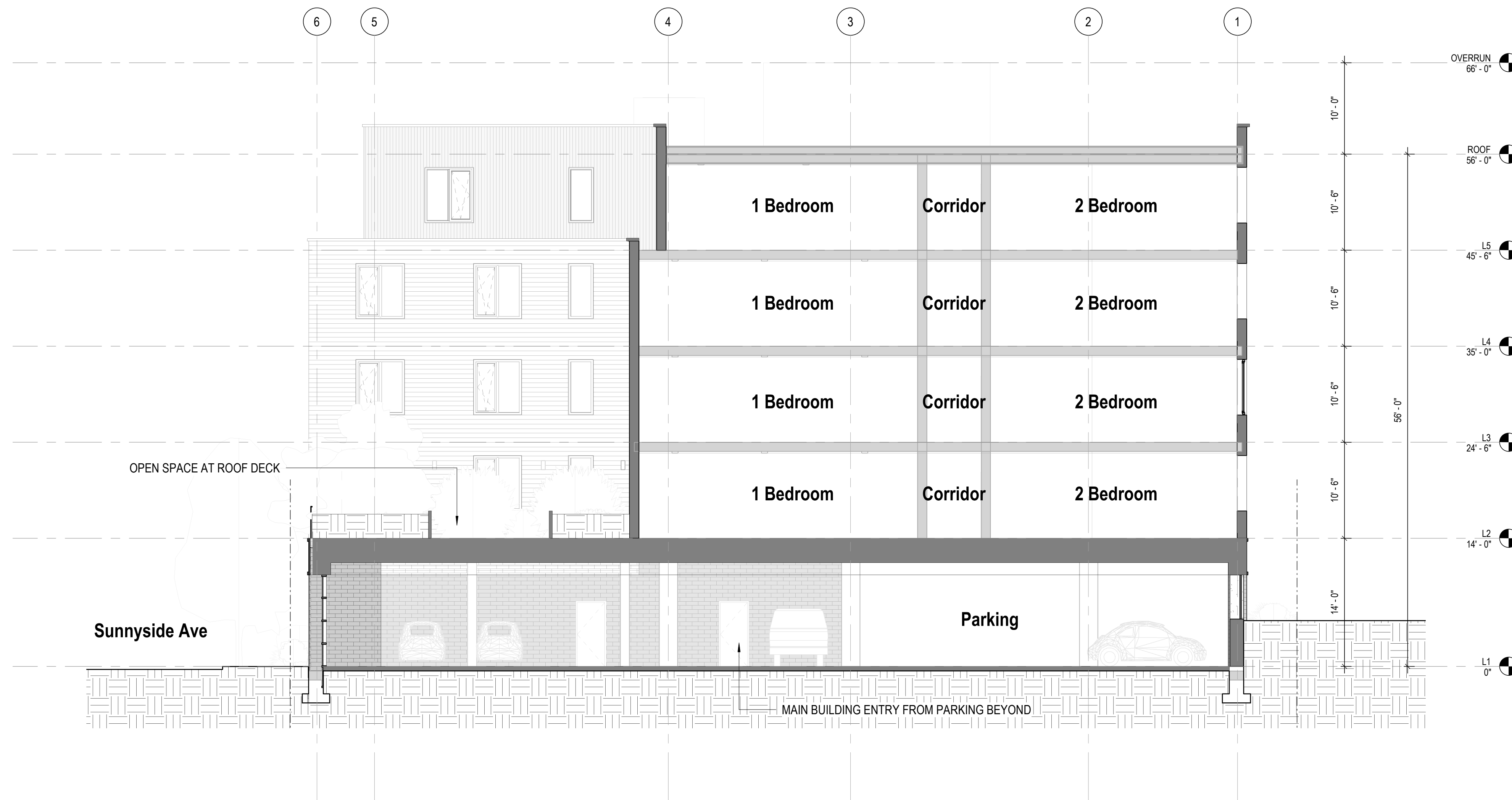
1 SECTION (NORTH-SOUTH) 1/8" = 1'-0"