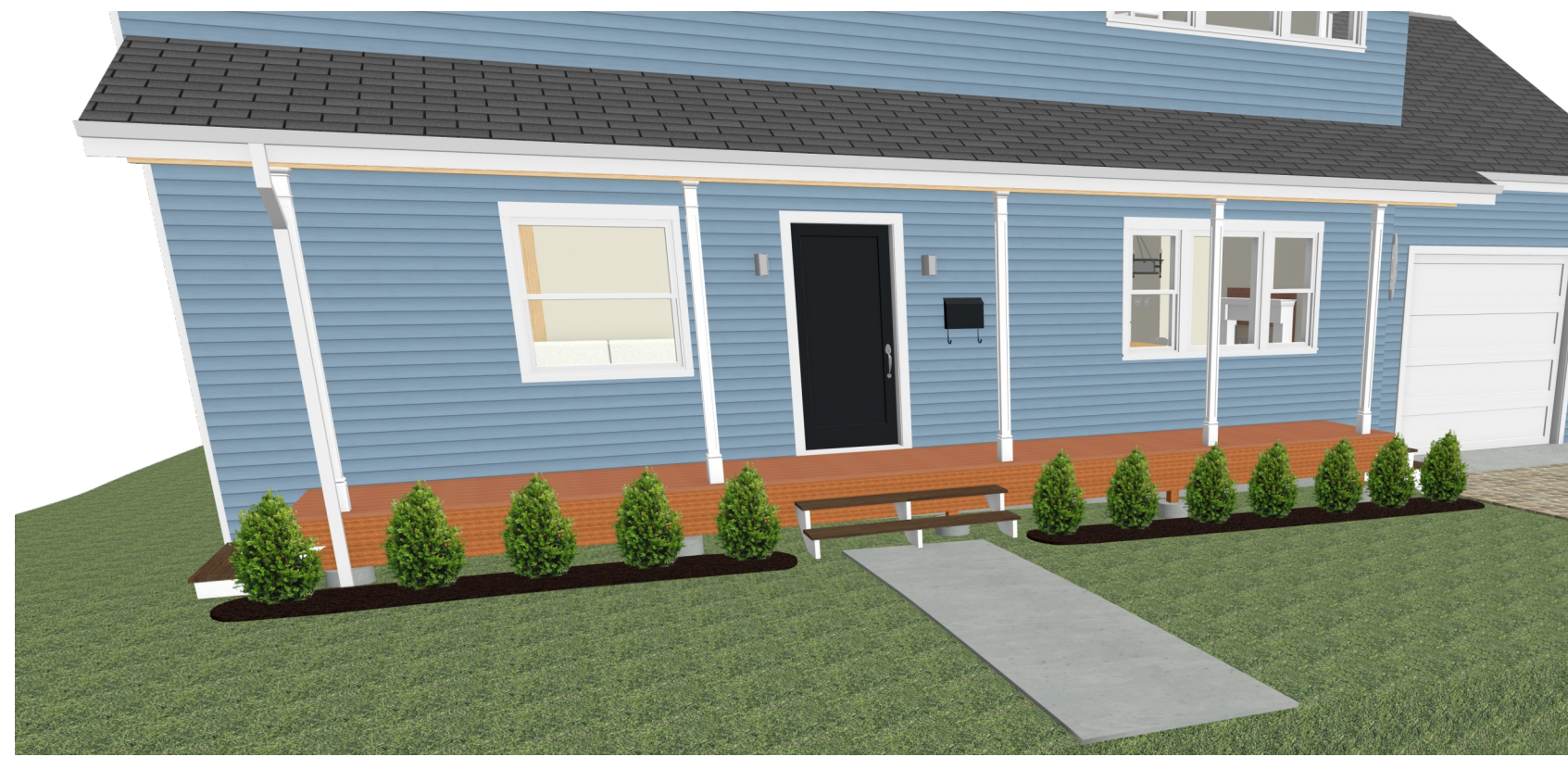
3D VIEW OF PROPOSED FRONT PORCH