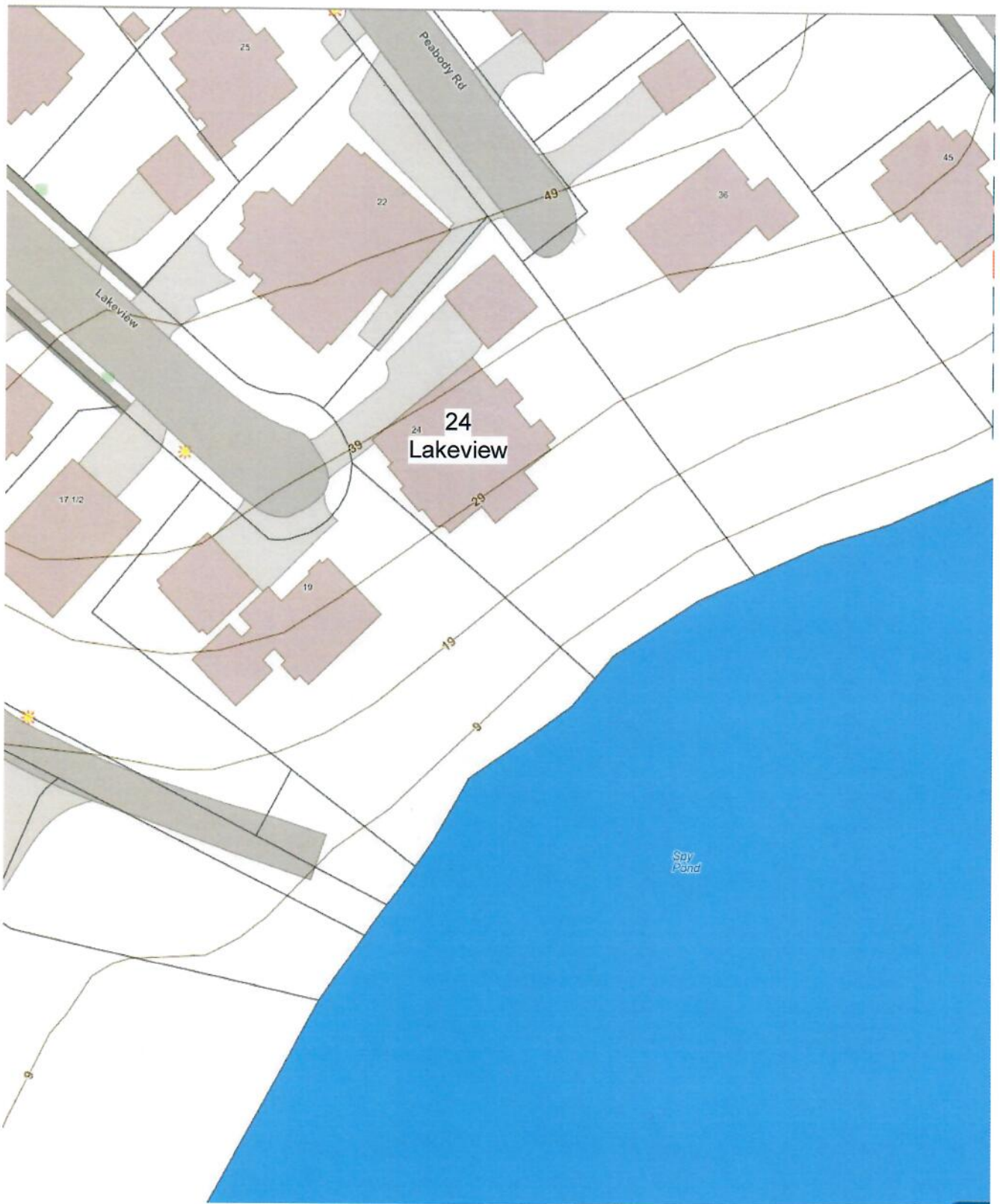
24 Lakeview Arlington MA Town of Arlington Topographical Map